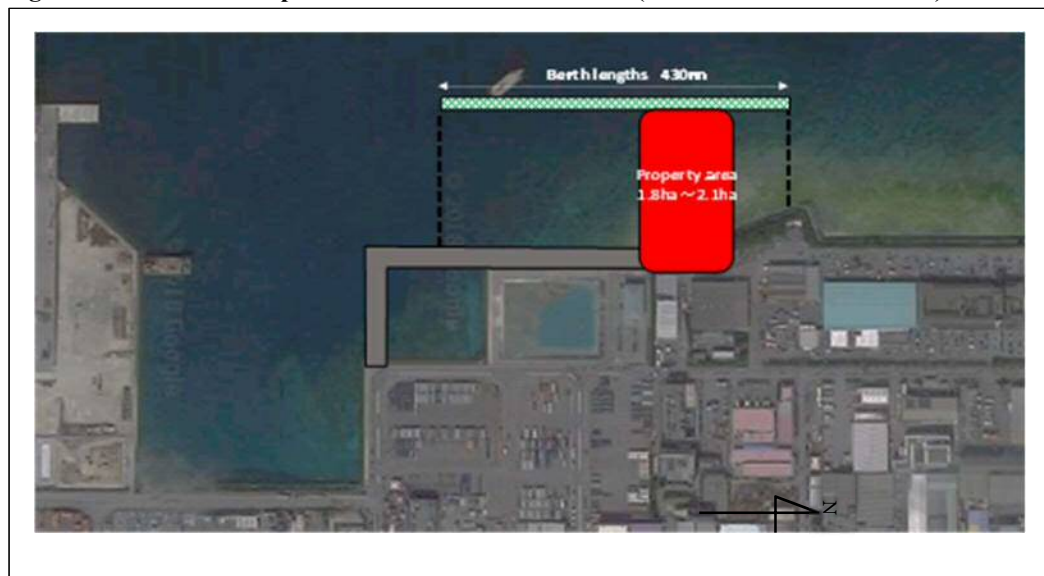
Figure 1-2: Outline image of The Second Cruise Berth when operations begin.

Note: The berthing facilities, property area and roads have not been well constructed, so reclamation works and construction will be needed in the future.